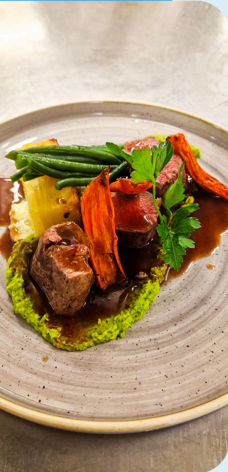
Photo of a student made main dish.

This was a truly wonderful evening that highlighted how skilled our students are.