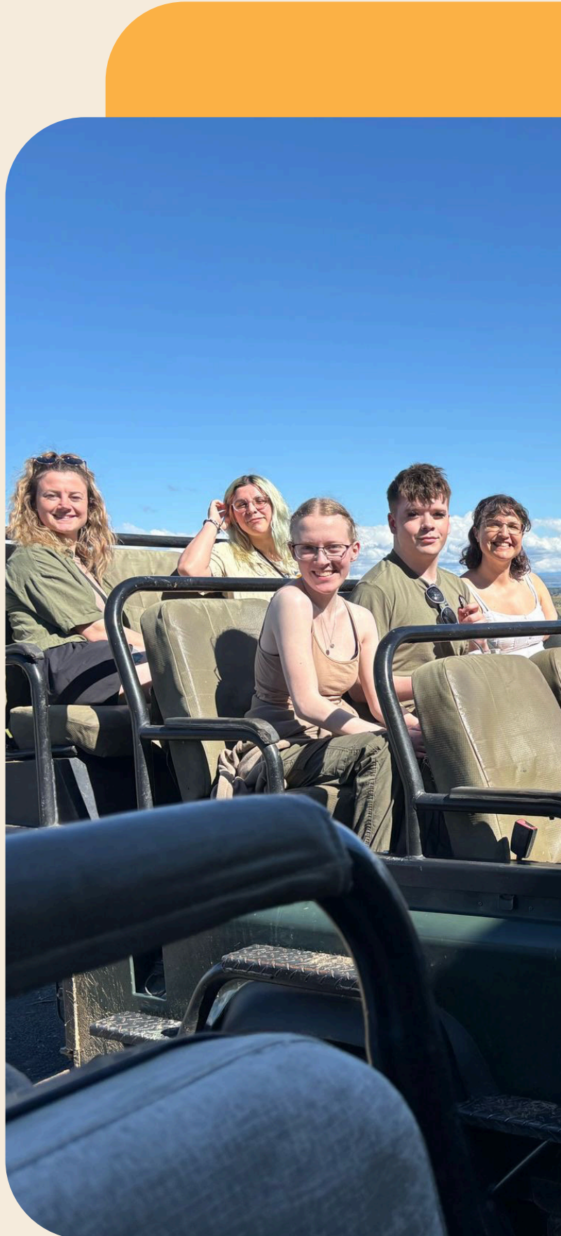
Photo of students at the Umphafa Nature Reserve, South Africa.

Students highlighted the once-in-a-lifetime exhilarating game drives, making it a truly unforgettable learning adventure.