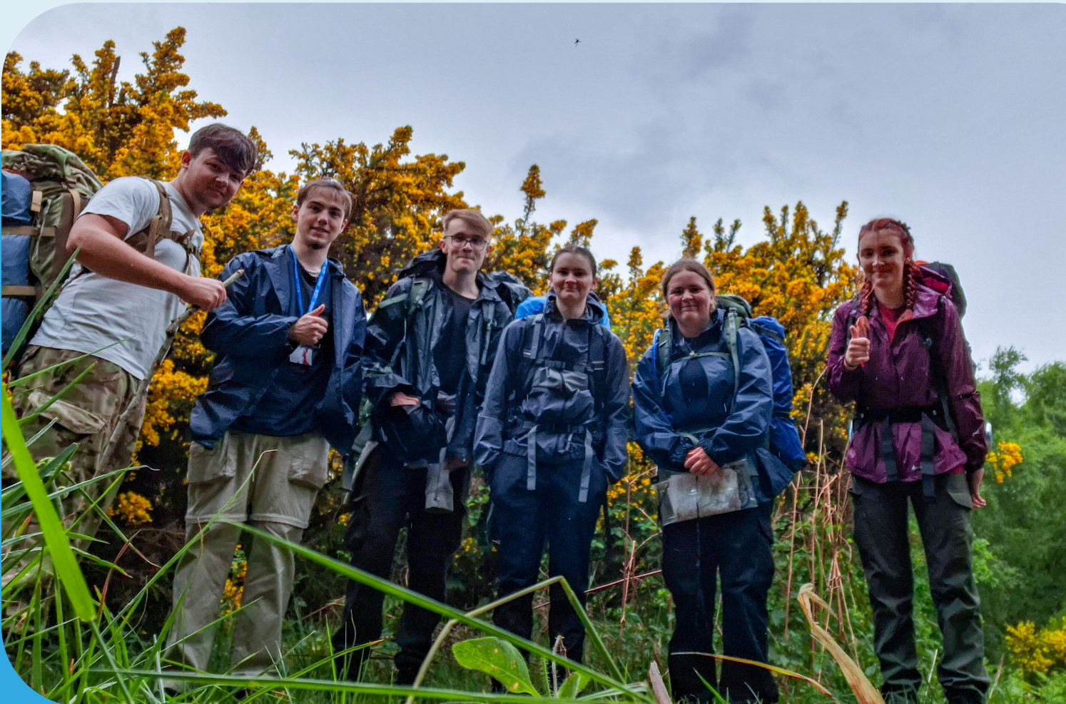
Photo of students on the Bronze Duke of Edinburgh expedition.

A fantastic display of resilience and teamwork for all!