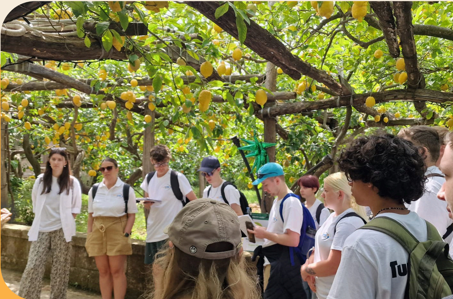
Photo of the students at the beautiful "I Giardini Di Cataldo Sorrento" (The Lemon Grove)

Naples for some slices of authentic pizza, a scenic boat trip around the Island of Capri and relaxing days at the beach.