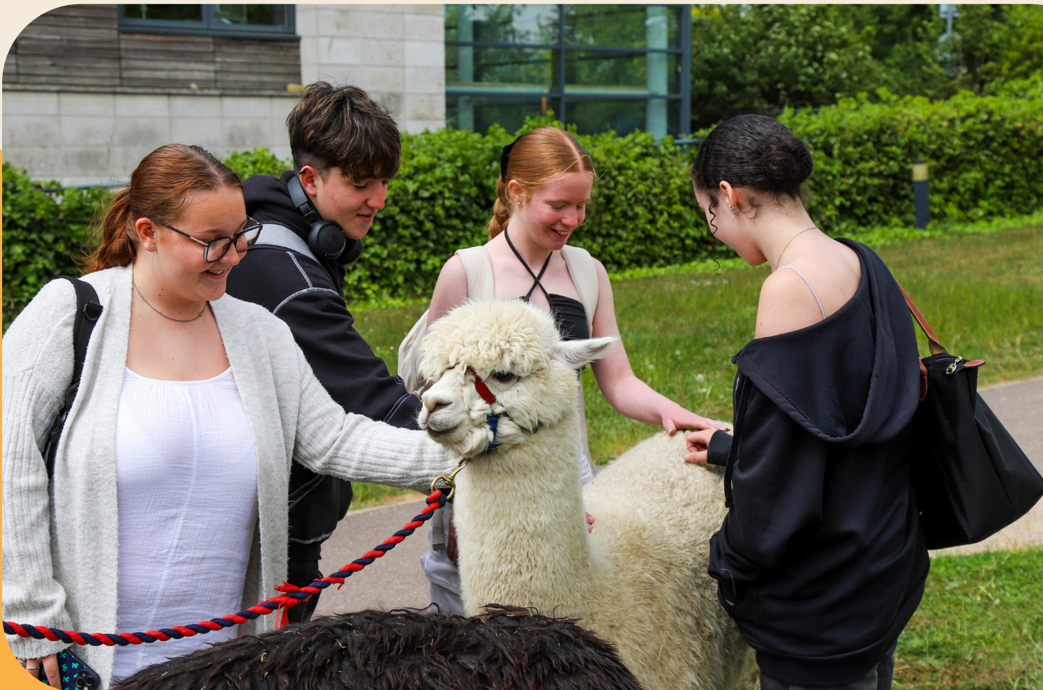
Photo of Unicorn Alpacas Walks in Suffolk's Alpacas at our Lowestoft Campus.

A true highlight was the visit from Unicorn Alpacas Walks in Suffolk, bringing many smiles to everyone across our campuses.